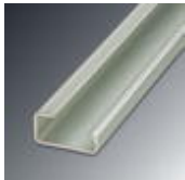
G rail 32 mm (NS 32)

DIN rail - NS 32 AL UNPERF 2000MM - 1201028