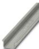
DIN rail, material: Steel, unperforated, 2.3 mm thick, height 15 mm, width 35 mm, length: 2 m

DIN rail - NS 35/15-2,3 UNPERF 2000MM - 1201798