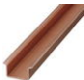
DIN rail, material: Copper, unperforated, 1.5 mm thick, height 15 mm, width 35 mm, length: 2 m

DIN rail - NS 35/15 CU UNPERF 2000MM - 1201895