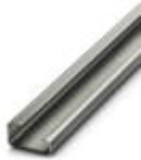
G-profile DIN rail, material: Steel, unperforated, height 15 mm, width 32 mm, length 2 m

DIN rail - NS 32 UNPERF 2000MM - 1201015