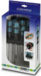
Screwdriver set, bladed/crosshead Phillips Recess ® , 6-part, incl. rack

Please be informed that the data shown in this PDF Document is generated from our Online Catalog. Please find the complete data in the user's documentation. Our General Terms of Use for Downloads are valid ( http://phoenixcontact.com/download )