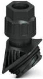
EVO plastic cable gland with bayonet locking, for housing series D, size M25, cable diameter: 9 ... 17 mm.

Please be informed that the data shown in this PDF Document is generated from our Online Catalog. Please find the complete data in the user's documentation. Our General Terms of Use for Downloads are valid ( http://phoenixcontact.com/download )