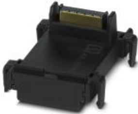
Axioline F bus base module for housing type BK

Please be informed that the data shown in this PDF Document is generated from our Online Catalog. Please find the complete data in the user's documentation. Our General Terms of Use for Downloads are valid ( http://phoenixcontact.com/download )